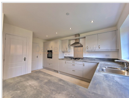
Kitchen/ Diner (21' 01" Max x 14' 11" Max) or (6.43m Max x 4.55m Max)

UPVC double glazed window to front aspect, plain ceiling, plain walls, two radiators.