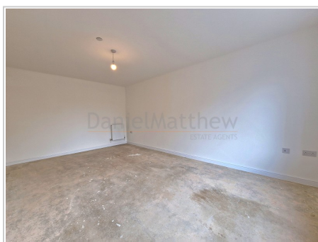
Lounge (17' 06" x 10' 11") or (5.33m x 3.33m)

UPVC double glazed obscured window to front aspect, plain ceiling, plain walls with tiled splashback, low level WC, pedestal wash hand basin, radiator.