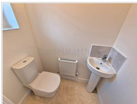
Cloakroom/w.c (5' 04" x 3' 0") or (1.63m x 0.91m)

Enter via composite door to hallway, comprising plain ceiling, plain walls, storage cupboard, stairs to first floor, door to ground floor rooms.