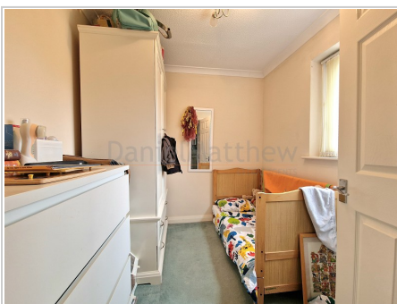
Bedroom Four (7' 07" x 7' 05") or (2.31m x 2.26m)

UPVC double glazed window to rear aspect, textured ceiling, plain walls, laminate flooring, radiator.