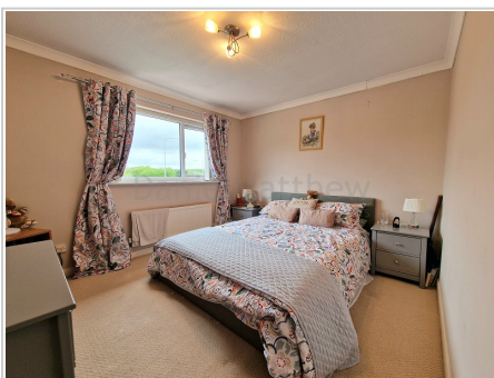
Bedroom One (10' 09" x 9' 03") or (3.28m x 2.82m)

UPVC double glazed window to rear aspect, textured ceiling, plain walls, carpet flooring, airing cupboard, doors leading to all first floor rooms.