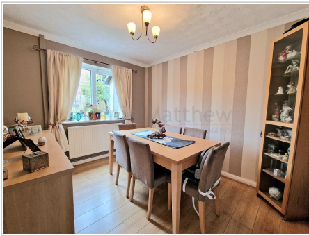
Dining Room (9' 06" x 8' 03") or (2.90m x 2.51m)

UPVC double glazed window to rear aspect, textured ceiling, plain walls with feature wall, laminate flooring, radiator.