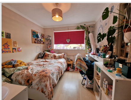
Bedroom Two (8' 08" x 9' 04") or (2.64m x 2.84m)

UPVC double glazed window to front aspect, textured ceiling, plain walls, carpet flooring, radiator, built in cupboards.